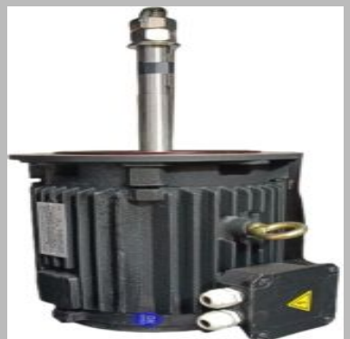
Cooling Tower Motor