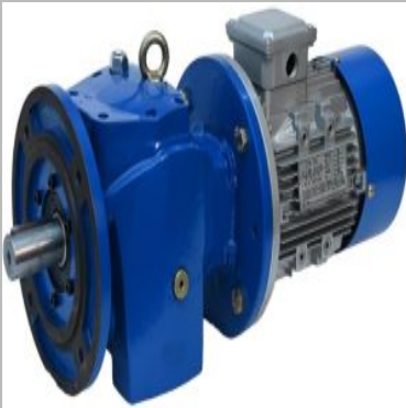
Flange Mounting Gearbox