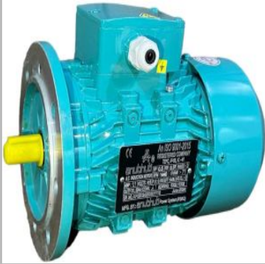
Three Phase Motor