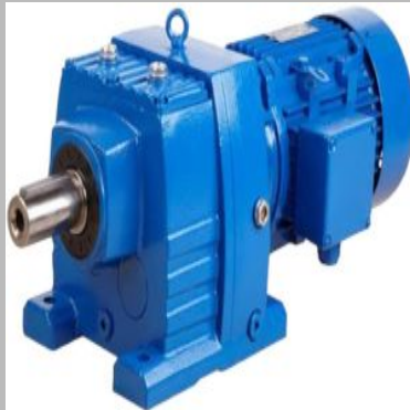
Mild Steel Inline Helical Gearbox