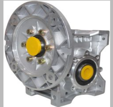
Mild Steel Worm Gearbox