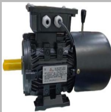
Crane Duty Motor