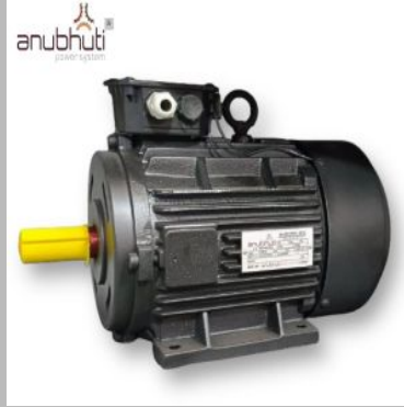
dual speed motor