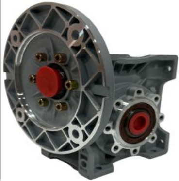
Worm Gear Reducer