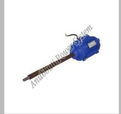
Cheese Winder Motor