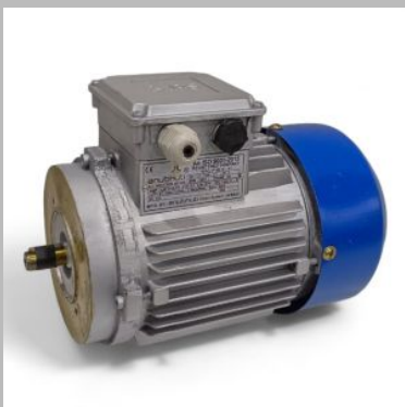
Face Mounted Motor