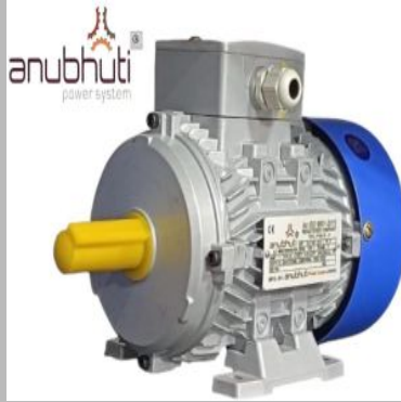
three phase electrical motors