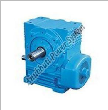
NU Type Gearbox