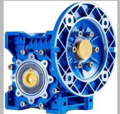
aluminum worm gearbox