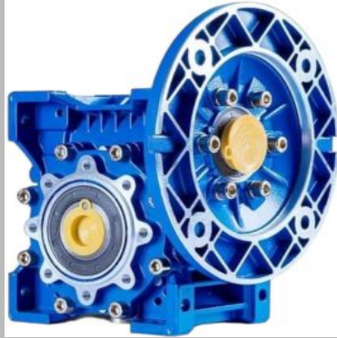
aluminum worm gearbox