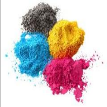
Metal Complex Solvent Dyes