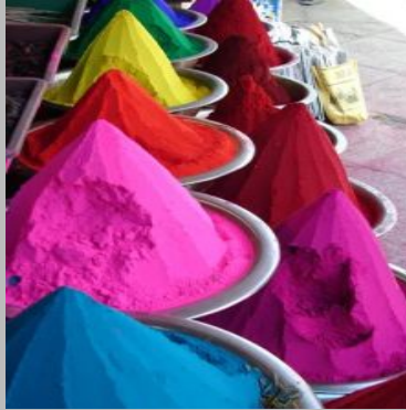
Acid Metal Complex Dyes