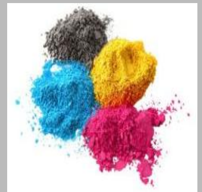
Mordant and Direct Dyes