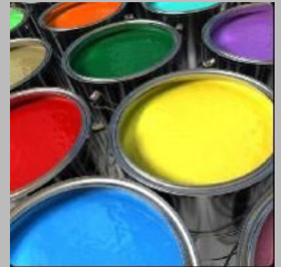
Industrial Dyes Chemicals