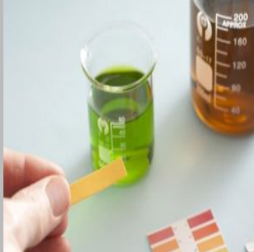
PH Indicators Solution