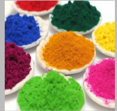
Powder Basic Dyes