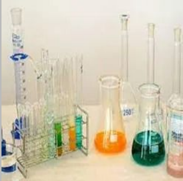
Photographic Liquid Chemical