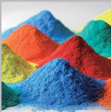
Multicolor Reactive Dyes