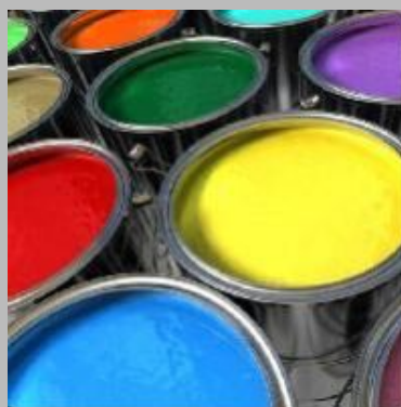
Industrial Dyes Chemicals