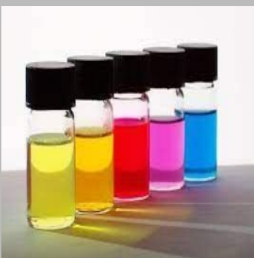
Industrial Liquid Dyes