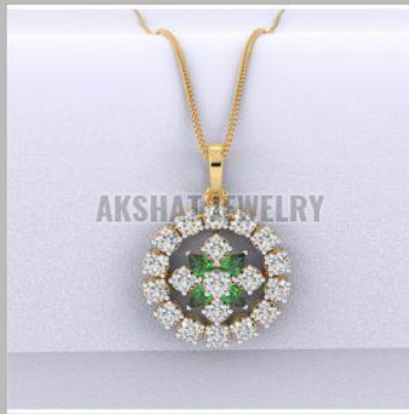
Pear Emerald Round Gold Pendant