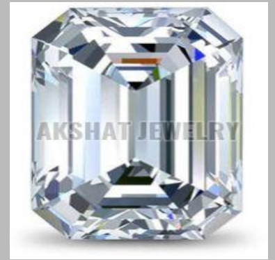
0.41 Carat Emerald Lab Grown Diamond