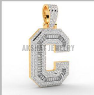
C Type Hiphop Diamond Pendant