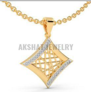
The Squad Design Diamond Pendant