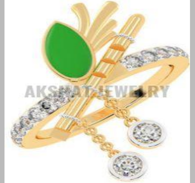
Krishna Flute Inspired Diamond Ring