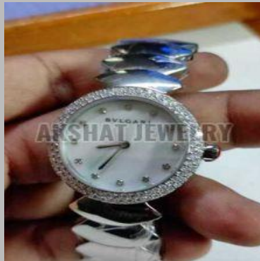
Round Fancy Moissanite Diamond Wrist Watch