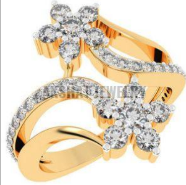
Twin Flower Designer Diamond Ring