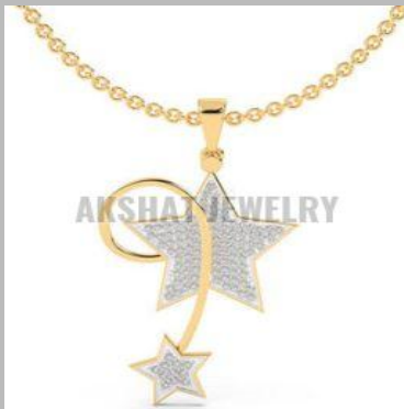
Stylish Stary Design Diamond Pendant