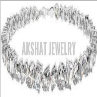
In Linear Line Different Shape Lab Grown Bracelet