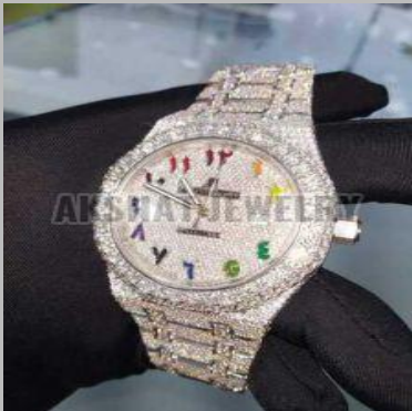
Trending Isolated Look Diamond Wrist Watch