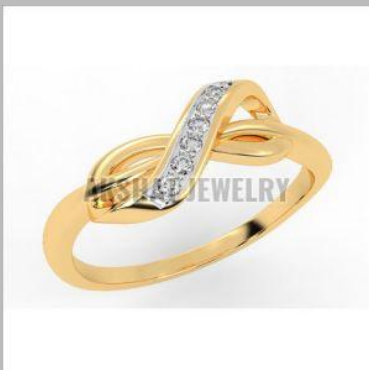
Infinity Diamond Gold Ring