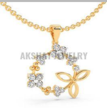
Enchanting Butterfly Circle Diamond Pendant