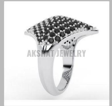
Black Diamond Ring