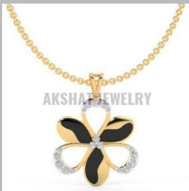
Designer Enamel Design Diamond Pendant