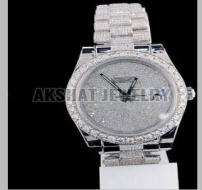
Trending Moissanite Diamond Studded Amazing Wrist Watch