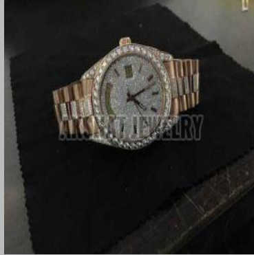
Trending Moissanite Diamond Studded Wrist Watch