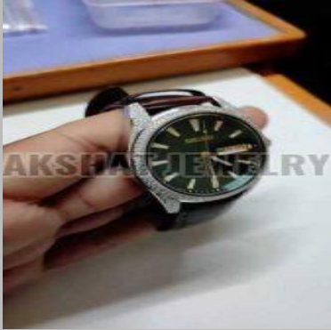
White Moissanite Trending Diamond Studded Wrist Watch