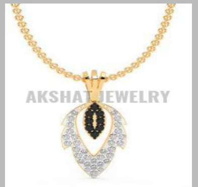
Dazzling Diamond Pendant