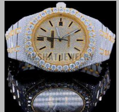
Round Moissanite Diamond Elegant Wrist Watch