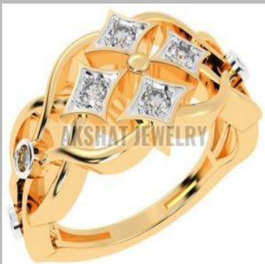
Intricate Jali Design Ring