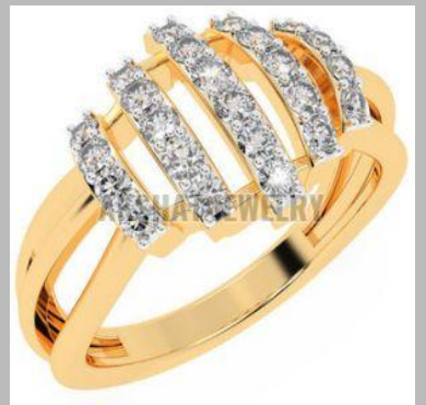
Five Strap Design Diamond Ring