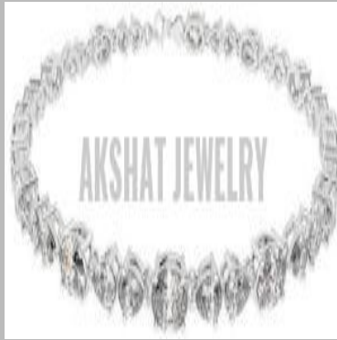
Sleeping Oval and Pear Shape Lab Grown Diamond Bracelet