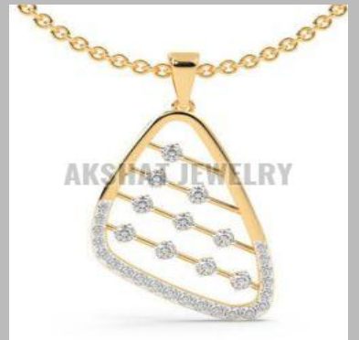
Stylish Diamond Pendant