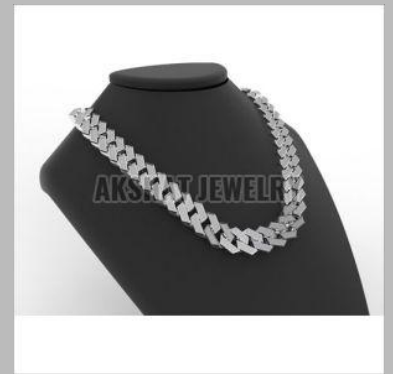
Hiphop Cuban Chain