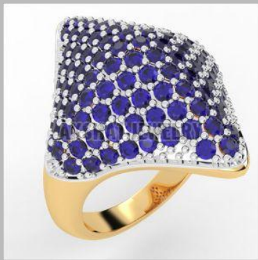
Blue Gems Gold Ring