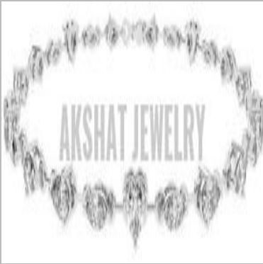
Three Shape Combination Lab Grown Diamond Bracelet