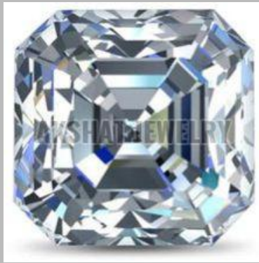
0.54 Carat Asscher Lab Grown Diamond