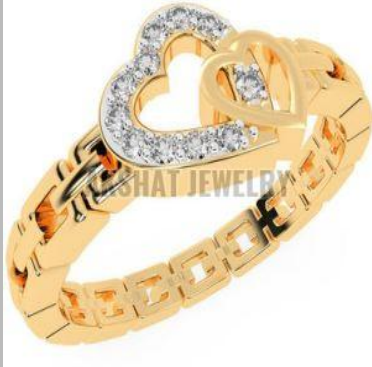
Twin Heart Diamond Ring