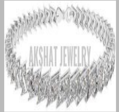
Lab Grown Diamond Bracelet