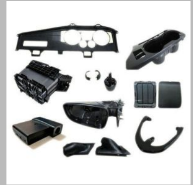
Plastic Moulded Automotive Components