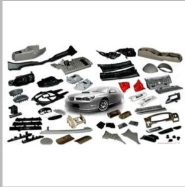
Four Wheeler Plastic Moulded Components