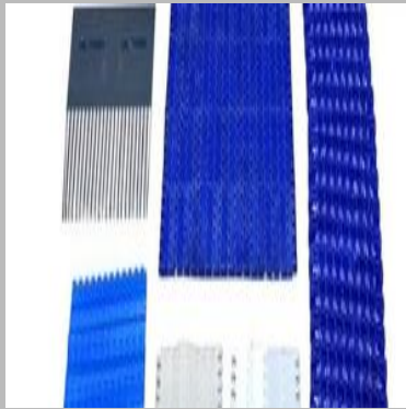
Plastic Moulded Components Links & Cleats