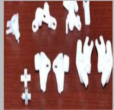
Plastic Moulded Locking Lever