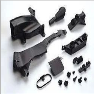
Automotive Moulded Plastic Parts

Ahuja Plastic Udyog is known as top Manufacturer, Exporter, Supplier and Service Provider of best Architectural Modeling, CAD, CAM Design & Drawing Services, Automotive Components, Cable Accessories, Door Handles and Equipment Case.