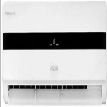
Voltas 1.4 Ton 3 Star Split AC