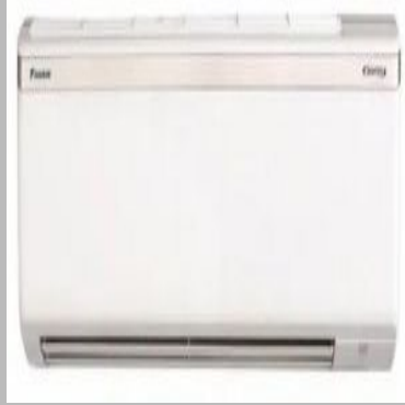
1.5 Ton Daikin Split Air Conditioner