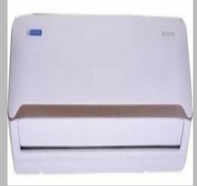
1.5 Ton Blue Star Split Inverter AC