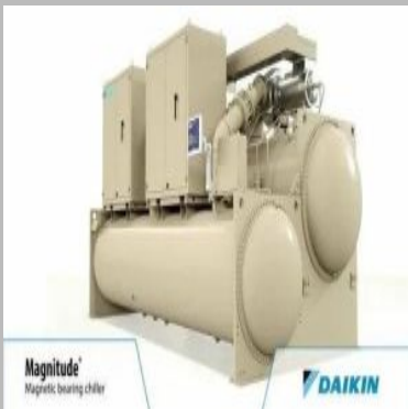
2 Ton Daikin Water Cooled Chiller