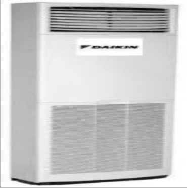
Daikin Tower AC