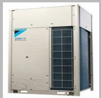
6 HP Daikin VRV X System