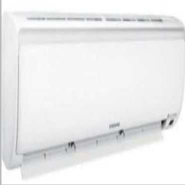
Samsung 1.5 Ton 3 Star Split AC