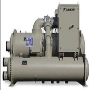
Daikin Water Cooled Chiller