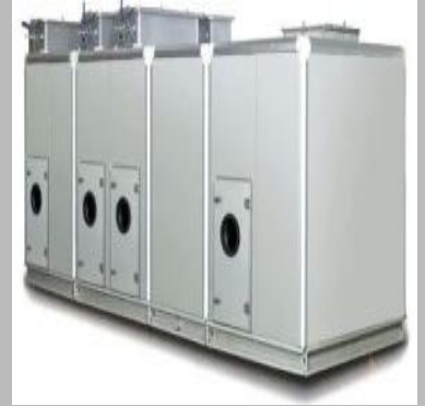
Daikin Air Handling Unit