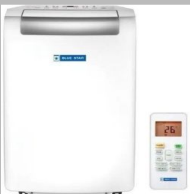
Blue Star 1 Ton Portable AC