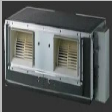
Ductable AC Unit