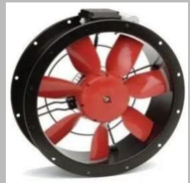
Industrial Exhaust Fan