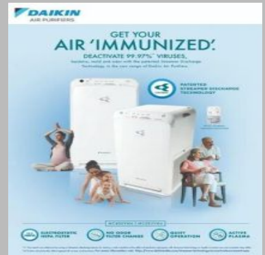
Daikin Air Purifier