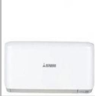
Mitsubishi 1.5 Ton 3 Star Split AC