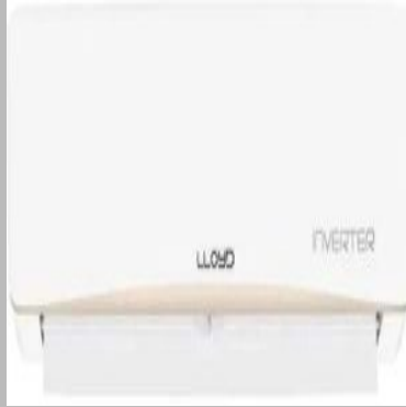
Lloyd 1.2 Ton 3 Star Split Inverter AC