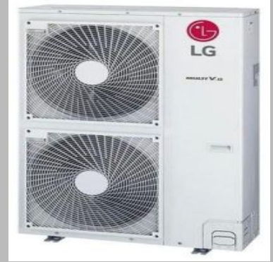
LG V4 AC Outdoor AC