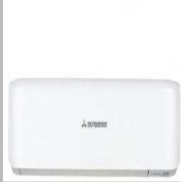
Daikin Cassette AC