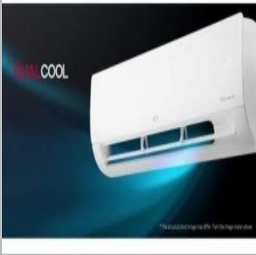
LG Dual Inverter Split Ac