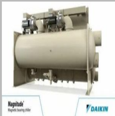
1 Ton Daikin Water Cooled Chiller