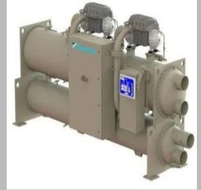
3 Phase Daikin Water Cooled Chiller