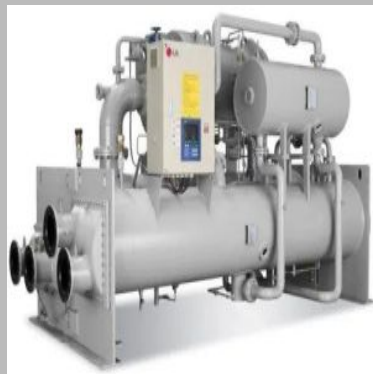
LG Centrifugal Chiller