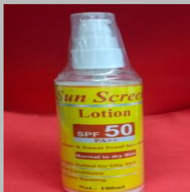
Spf 50 Sun Screen Lotion