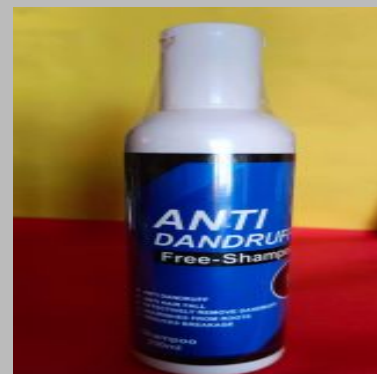
Dandruff Free Hair Shampoo