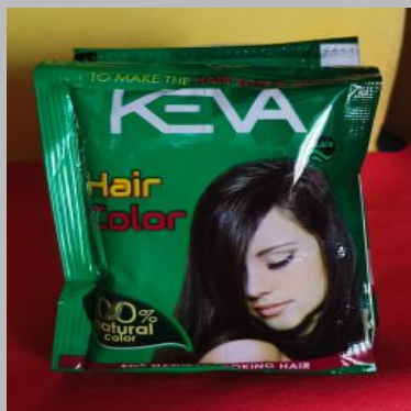
Ammonia Free Natural Black Hair Color

Aakash Herbs is known as top Supplier and Trader of best Ayurvedic Medicines, Cosmetics, Face Wash, Hair Oil and Hair Shampoo.